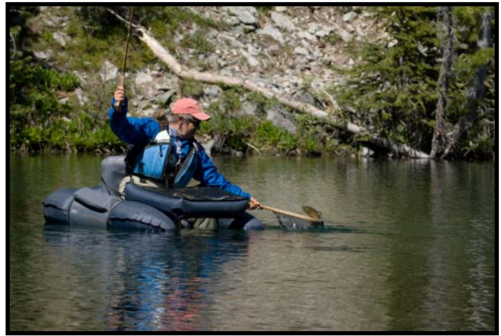
Float tube fishing on a High Mountain Lake

Mountain lake trips are often a family or friends "get together" where some of the group fish and others swim or just enjoy the ambiance of the mountain scenery and mountain air. Learn to fish from a float tube, fish from shore, wade fish or fish from a two or three person boat.