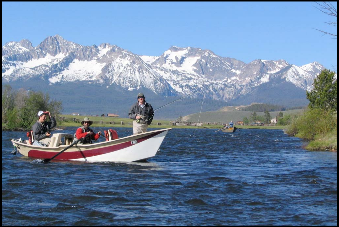
Float Fishing Main Salmon River near Stanley, Idaho – Summer 2007

Welcome to 2008 and dreams of fishing and exploring new waters and fishing with family and friends. We hope that the past year found many of you traveling to some great fishing destinations with memories of some unforgettable days.