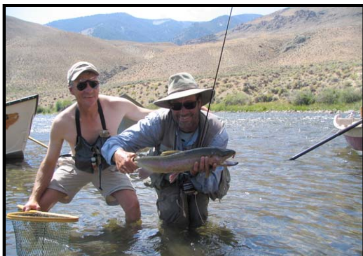
August 2007- Salmon River Rainbow measuring 26 1/2 inches